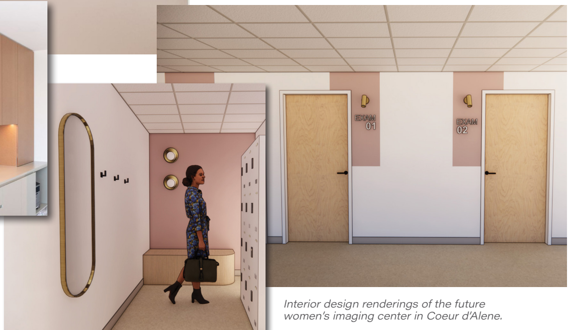
Interior design renderings of the future women's imaging center in Coeur d'Alene.