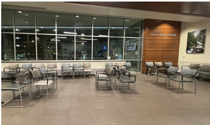
Emergency Department Lobby Before